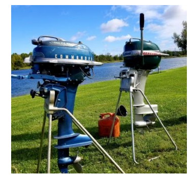
Chris Craft Commander & Mercury Cruiser Super 10 both ran at Spray Lake.