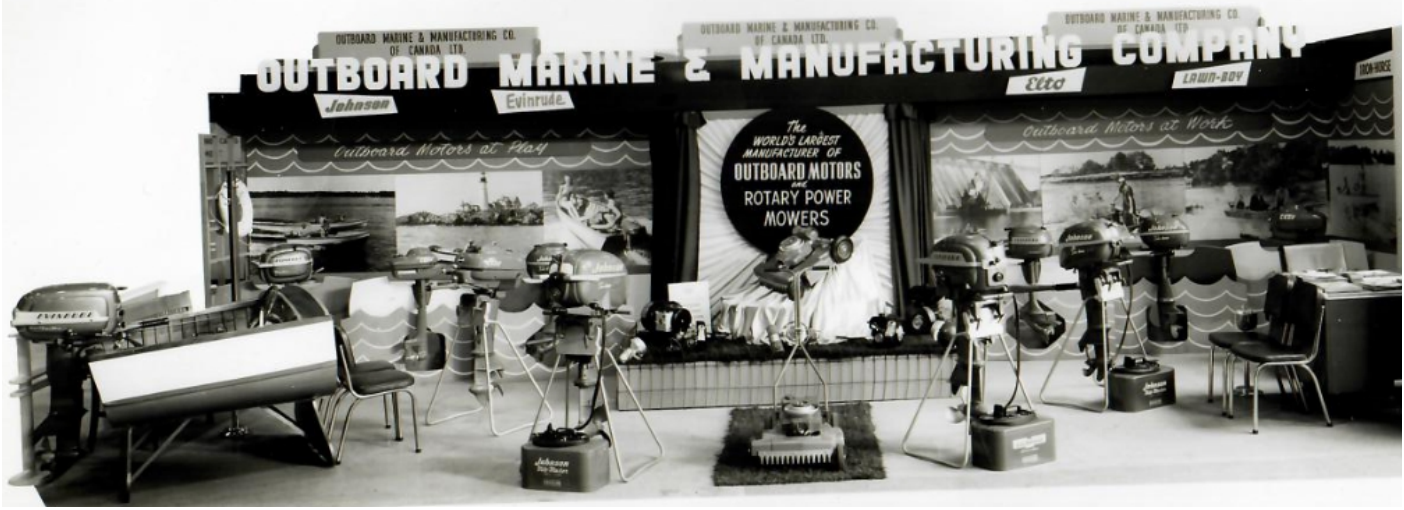
Early 1950's Outboard Marine display in Toronto showing Johnson, Evinrude and Elto Outboards as well as Lawn-Boy power mowers. The theme, OUTBOARD MOTORS AT WORK AND AT PLAY.

Lauson Outboard display at the 1952 New York Boat Show. Making the key points of difference. "4 CYCLE", "BETTER BY FAR BECAUSE IT'S BUILT LIKE A CAR", "NO MIXING OF OIL AND GAS".