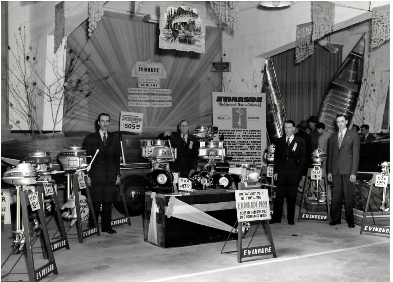
1946 Montreal Evinrude Dealer's display featuring the 50 hp “Big Four” and showing out front a 1909 Evinrude Row Boat Motor declaring, “WE'RE NOT NEW IN THE LINE”.