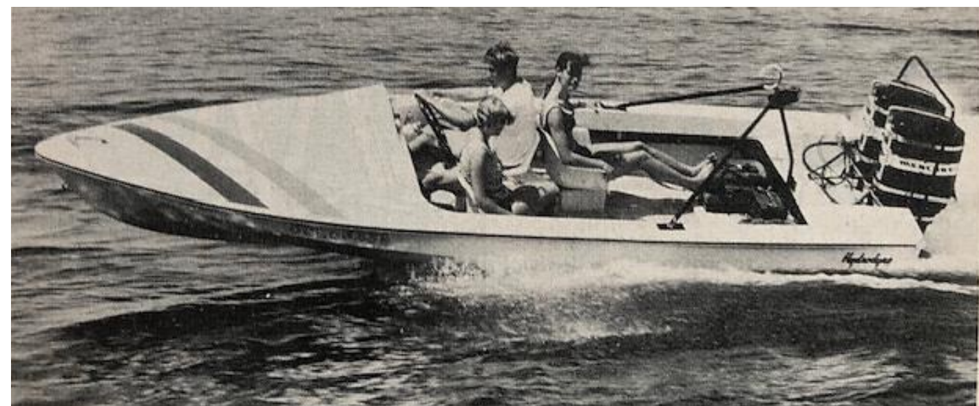
In 1967 the 10th World Water Ski Championships were held at Sherbrooke, Quebec. The official tow boat was this Hydrodyne hull powered by twin 6 cyl. Mercury 110 outboards. These rigs were the official tow boats of both the American and Canadian Water Ski Associations for many years. The shallow draft Hydrodyne hulls had low wakes at speed and were very popular with competitors for double cut jumping and slalom competitions. The towering twin 6 cyl. Mercs were intimidating to ski behind.