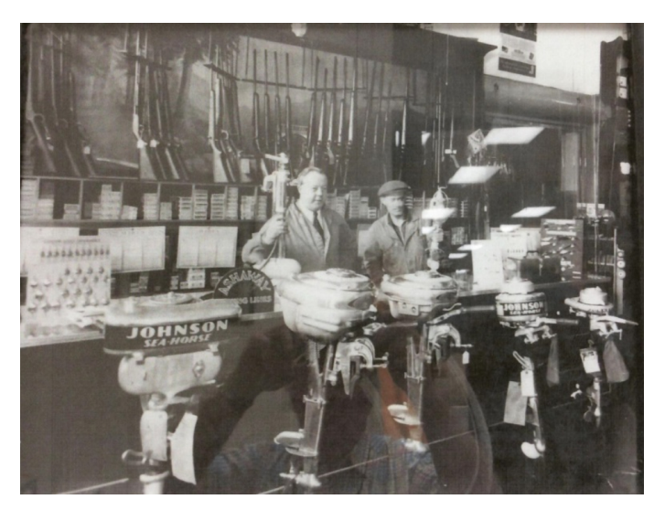
A 1938 picture of an outfitters store in Alaska with the two most popular outboards in the far north. Johnsons, which were easy to repair and would always get you home and the air cooled Bendix single and twin that would never freeze up and break. No water cooling system to drain.