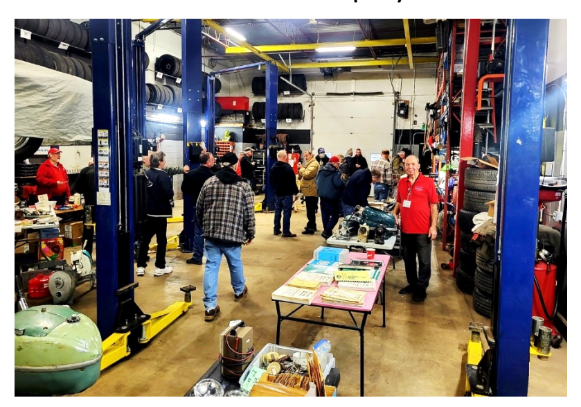
Overview of the early action at the vendors tables.