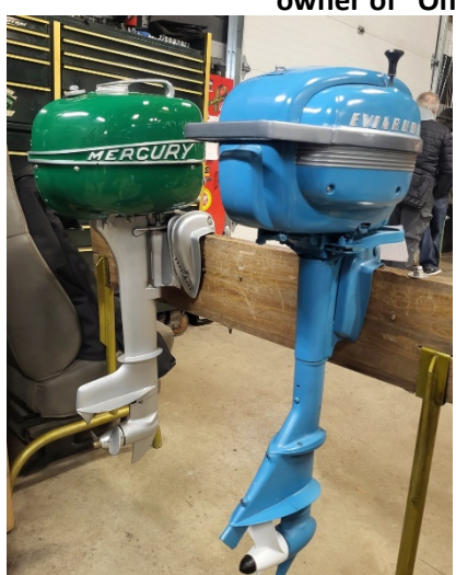
Nicely restored mid 50's Mercury & Evinrude.