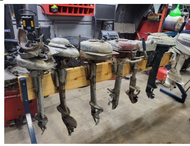
Lots of "Tried & True" small block Outboards For Sale.