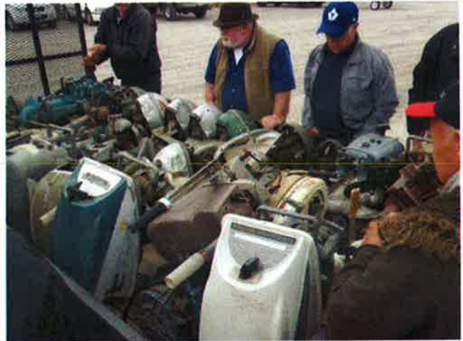
The boys are searching for a treasure among this abundant trailer load of Outboards.