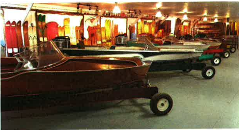
Wayne's line up of restored Aristo-Craft boats & collection of vintage water skies & surf boards.

A big turnout of about 90 members of the TSACBA and MLACO were not disappointed. Good weather and an expanded Museum Quality display of Wayne Robinsons unique collection of watercraft, model boats and nautical artifacts. This was supplemented by ten boats and motors from Ken Kirk's collection plus numerous boats and motors brought for the day by various Club members.