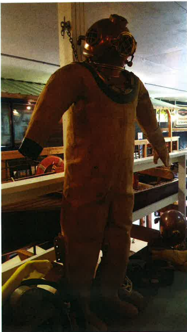
If you drop an Outboard overboard you can hire Wayne's hard hat driver to retrieve it.